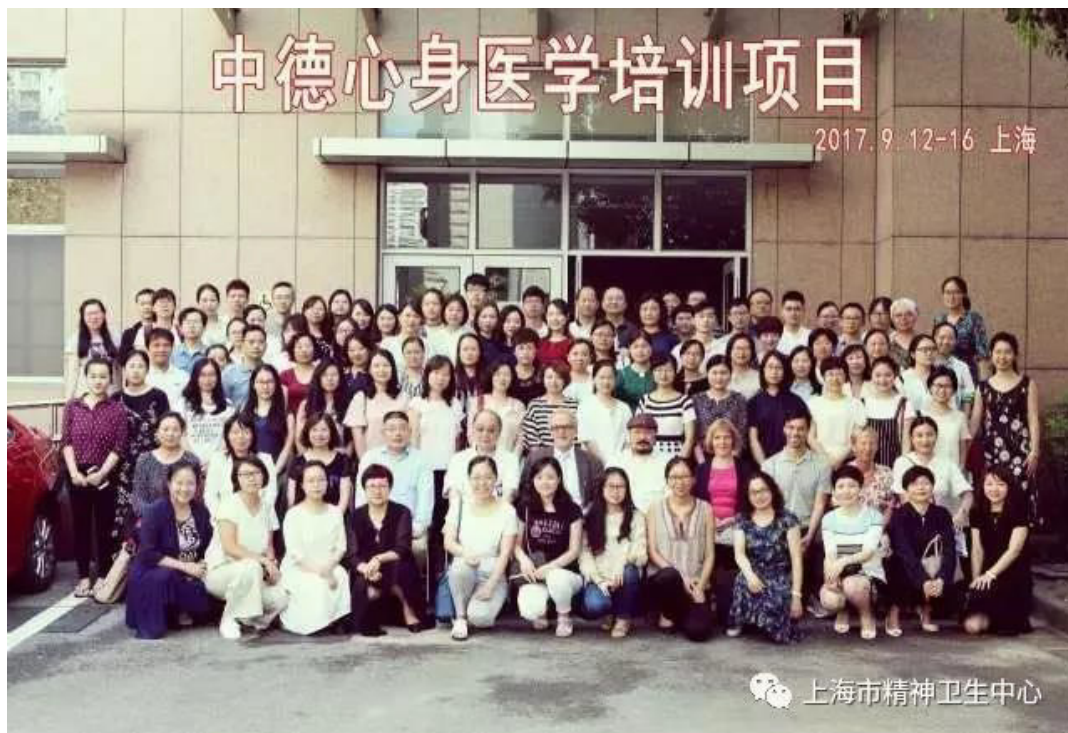
Photos of the opening ceremony

The feedback questionnaire shows that 99% of the participants thought that the content of this project has involved the latest development, achievements or the problems need to be solved urgently in the field, 100% of the students thought this program was very rewarding, especially in expanding horizons and improving skills, 100% of the students satisfied with the content. All of the participants appealed strongly expressed that they are expecting the advanced training, and looking forward to seeing all of the German teachers again in Shanghai.