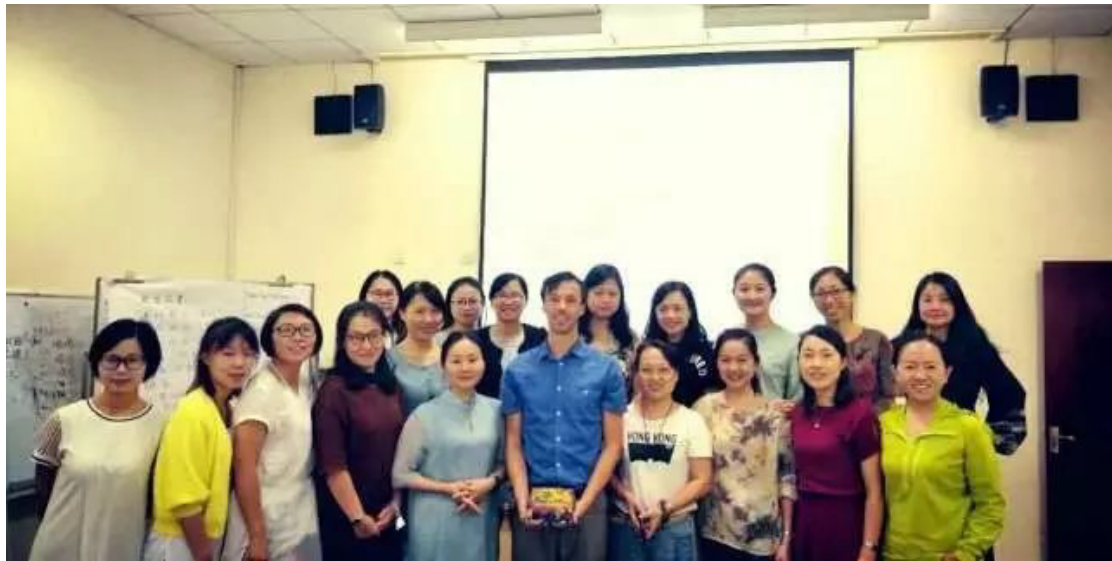
Photos of art therapist group