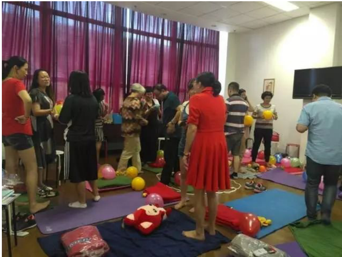
Photos of doctor group