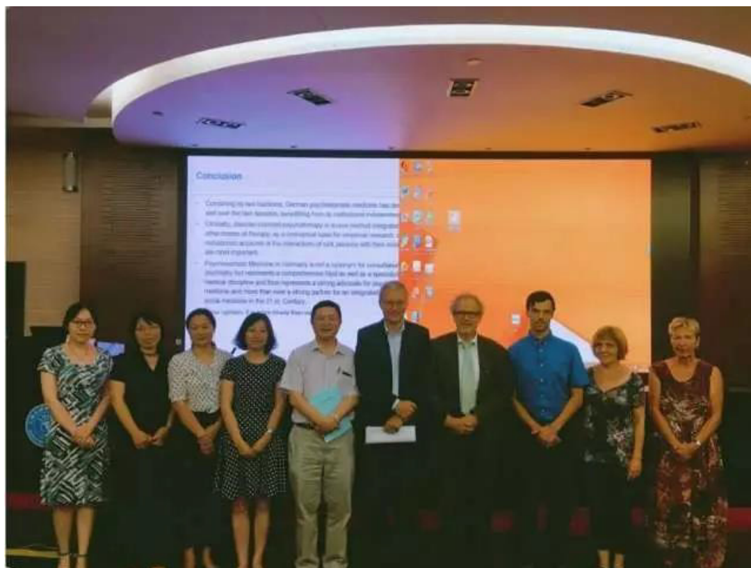
Photos of evening lectures