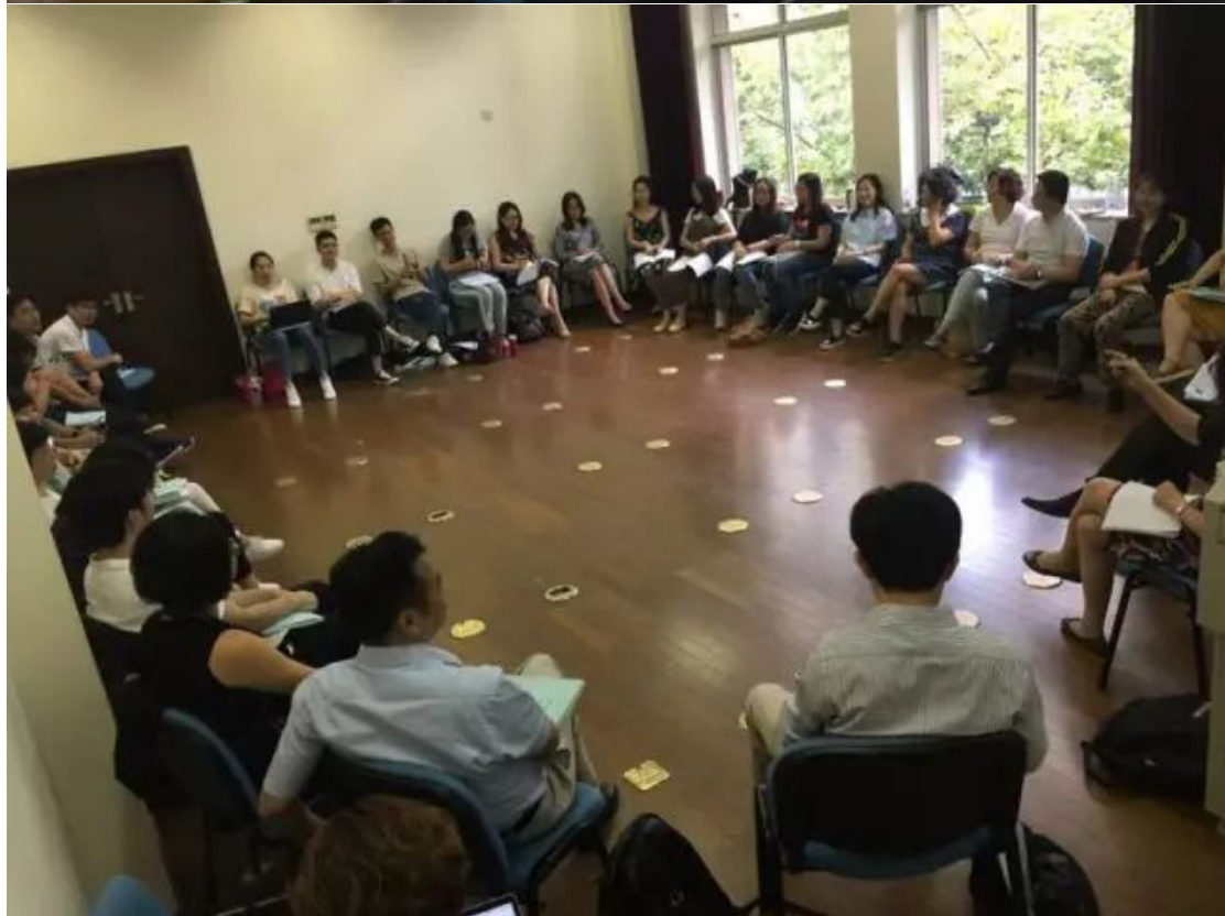
Photo of the end ceremony